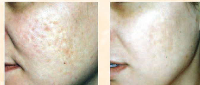
Pores and scarring